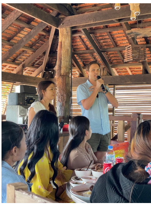
KAMPUCHEA HOUSE REUNION LUNCH NOVEMBER 2023