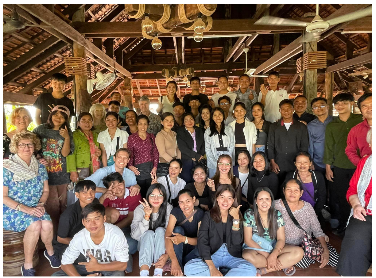
KH Reunion Lunch in Siem Reap November 2023