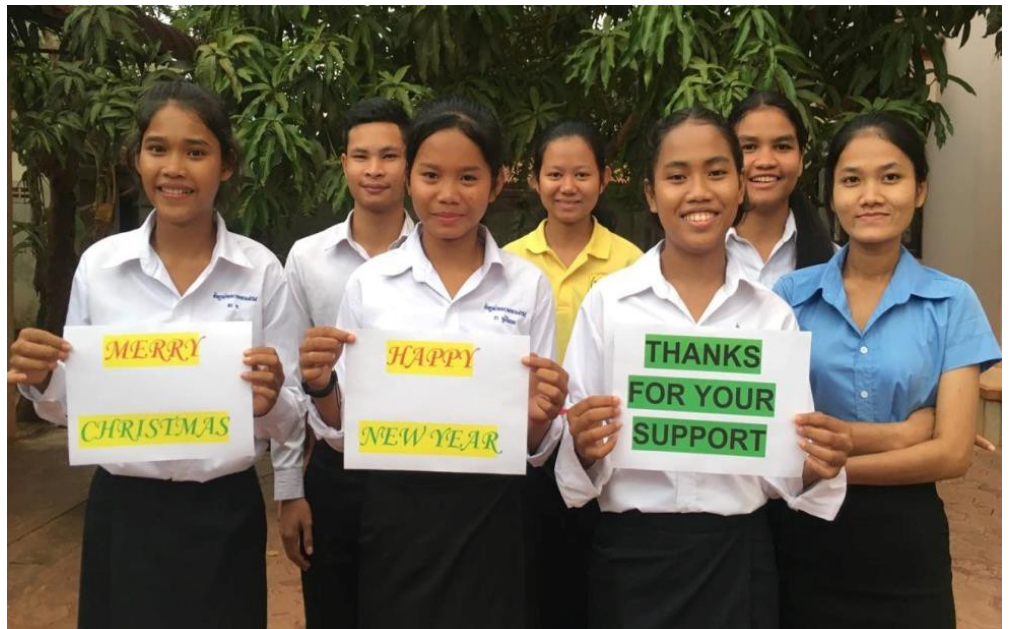
Some of our kids in Siem Reap created a photo Xmas card to show their appreciation for your support

And a special thank you to all the students and staff at Westbourne Grammar for your magnificent fund raising efforts on our behalf across the year and for the close fellowship you have built up with our kids in Siem Reap.